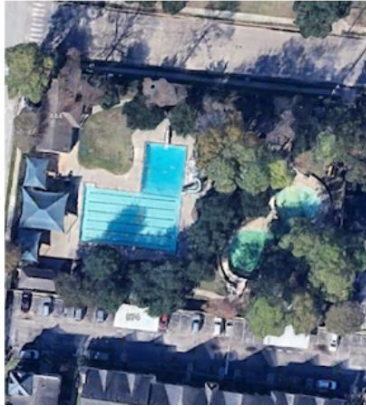
WILCHESTER POOL 880 Yorkchester Dr, Houston, TX 77079